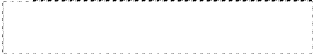
A Privy Council Office, Feb. 21, 2020, Intelligence Assessment Secretariat document. This redacted copy was provided to Parliament hearings.

According to CSIS, the United Front Work Department is the CCP's global-influence arm, a powerfully resourced organ that facilitates espionage and seeks to mobilize Diaspora communities to meddle in foreign states.