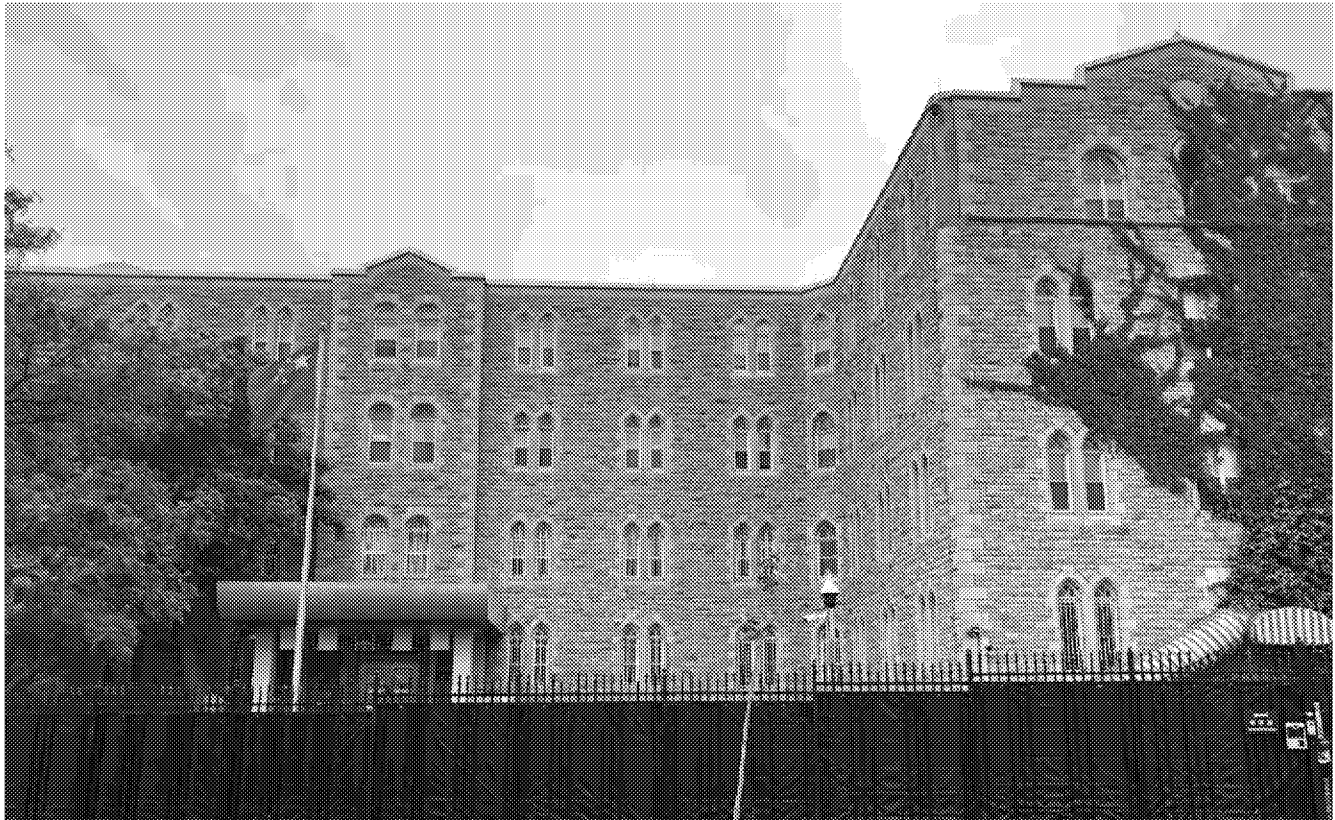
The People's Republic's Embassy in Ottawa.

Intelligence officials repeatedly warned Justin Trudeau's government that China views Canada as a "permissive environment to pursue its interference activities" and Beijing's incursions wouldn't diminish unless Ottawa pushed back, according