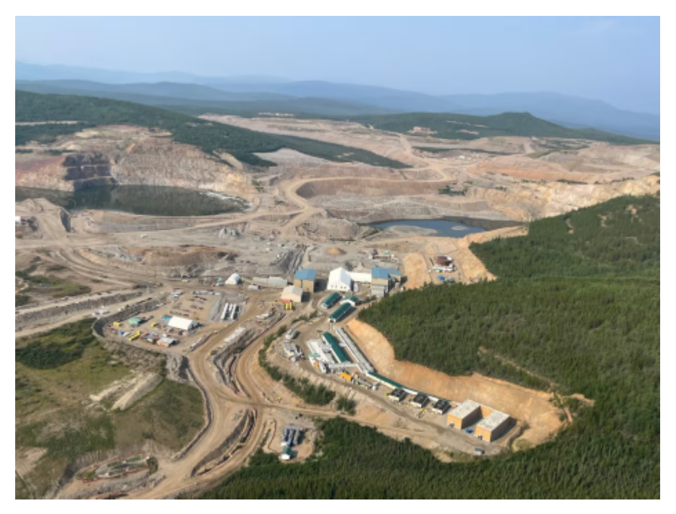
The copper-gold Minto mine was shuttered last year. Copper is a critical mineral needed for renewable energy projects. Experts say foreign investments need to be thoroughly vetted, in case there's a threat to national

Az ected by that demand is the Yukon, which is <u>seeing more exploration</u> for critical minerals. Of the 31 critical minerals listed by the federal government, only six had yet to be documented in the territory by 2022. Those include aluminum, helium and potash.